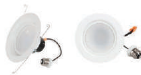
RETROFIT DOWNLIGHT Dimmable 4" - 10W 6" - 10W, 17W Recessed Lights, Recessed Trims