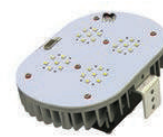
SHOEBOX RETROFIT KIT Non-Dimmable 60W, 80W, 100W, 120W, 150W, 200W, 240W, 320W, 400W Shoebbox, Wallpack, Canopy, Highbays