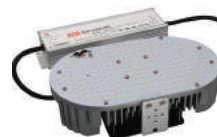
HIGH EFFICIENCY SHOEBOX RETROFIT KIT Non-Dimmable 60W, 80W, 100W, 120W, 150W, 200W, 240W, 300W, 400W, 480W Shoebbox, Wallpack, Canopy, Highbays