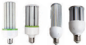
CORN LIGHTS: 1 ST , 2 ND , 3 RD GEN Non-Dimmable 9W, 12W, 15W, 16W, 20W, 30W, 36W, 40W, 45W, 60W, 75W, 80W, 100W, 120W, 150W Shoebbox, Wallpack, Canopy, Highbays