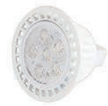
MR16 Non-Dimmable (Dimmable coming soon) 7W Spotlight, Track Lighting